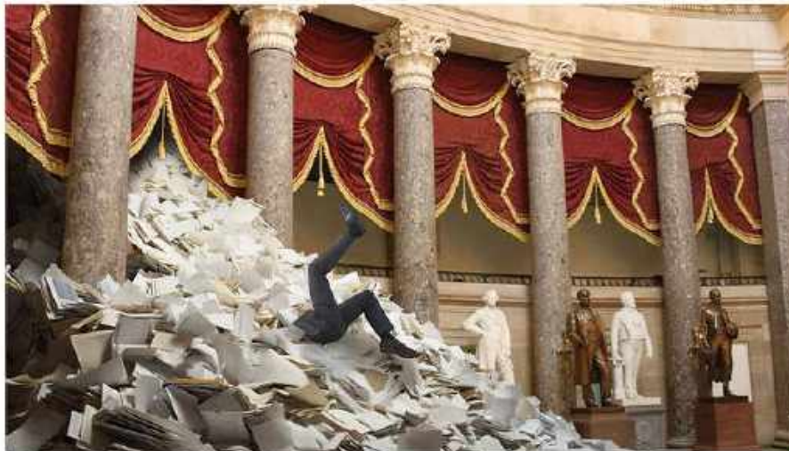
Dozens Injured At Capitol After Omnibus Bill Tips Over

The Omnibus spending bill to keep the government going, yet again, is 1,012 pages. The crap in there must be impressive. "New spending bill contains at least $9 million in earmarks from deceased senator Diane Feinstein." The Bee captures the horror: